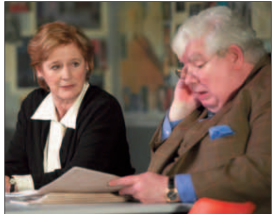
Maggie Steed as Mrs Lintott with Richard Griffiths as Hector

The History Boys, directed by Nicholas Hytner, following its huge UK success, played to full houses throughout its' demanding whistle-stop tour of Hong Kong, Wellington, Sydney and finally New York, where the play picked up a total of 17 drama awards - it is certainly a play well worth seeing!